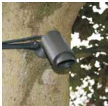
E4171 with E4027 Rotashield on E4013R strap-on mount