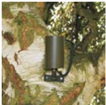
Uplighting a canopy: a locking nut holds the spotlight in place

Moonlighting is the effect created by lighting downward from low power lights in a tree to shadow the lower branches and foliage onto the ground below. This subtle, dappled lighting effect over a tree seat, lawn, patio, path, drive or border is one of the most natural lighting effects in a garden