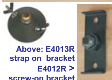
Above: E4013R strap on bracket E4012R > screw-on bracket