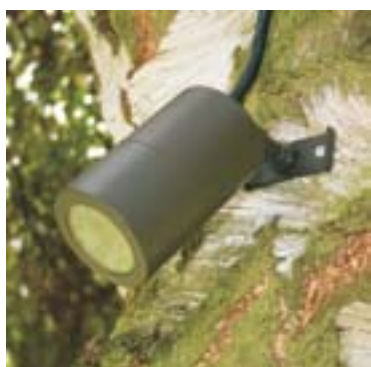
E4171 on E4012R screw-on mount

The Elipta strap-on tree mount spotlight system consists of five strap sizes and E4013R strap-on tree mount which converts the E4171 rustic brown Compact spotlight to a tree-mount spotlight. MR16 60° lamps offer the widest beam angle options for moonlighting and canopy uplighting applications: led modules may be used as a low energy option, with a MR16ASL spread lens which widens the beam for greater coverage. Tree straps loop over threaded studs on the strap-on mount and will stretch to fit around branches or trunks to provide secure mounting and flexibility for growth. Washers and wing-nuts are provided to secure the strap in place on the mount studs. E4010 honeycomb glare louvre may be fitted behind the lens to reduce the visibility of the light source and reduce glare, while the MR16AMDF moonlighting (pale blue) filter may be clipped onto the lamp inside to provide a cool lighting effect. E4013R screw-on tree mount caters for mounting on large trunks or trellis structures and can be strapped onto small branches with two standard tree straps.