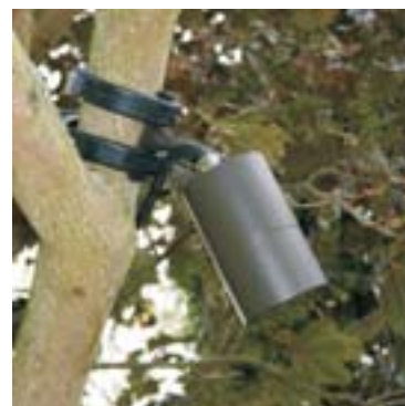
E4171 on E4012R mount straps onto small branches