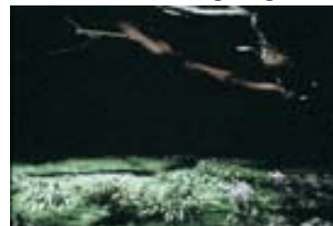
MR16AMDF moonlighting filter provides a cool lighting effect

Allow 50cm for strap-on mount when selecting strap size