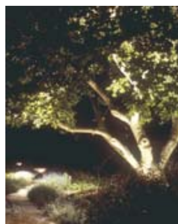
Uplighting a tree complements moonlighting to provide a more three-dimensional lighting effect