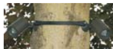
Twin spotlight mounting

The Elipta strap-on tree mount spotlight system consists of five strap sizes and E4013R strap-on tree mount which converts the E4171 rustic brown Compact spotlight to a tree-mount spotlight. MR16 60° lamps offer the widest beam angle options for moonlighting and canopy uplighting applications: led modules may be used as a low energy option, with a MR16ASL spread lens which widens the beam for greater coverage. Tree straps loop over threaded studs on the strap-on mount and will stretch to fit around branches or trunks to provide secure mounting and flexibility for growth. Washers and wing-nuts are provided to secure the strap in place on the mount studs. E4010 honeycomb glare louvre may be fitted behind the lens to reduce the visibility of the light source and reduce glare, while the MR16AMDF moonlighting (pale blue) filter may be clipped onto the lamp inside to provide a cool lighting effect. E4013R screw-on tree mount caters for mounting on large trunks or trellis structures and can be strapped onto small branches with two standard tree straps.