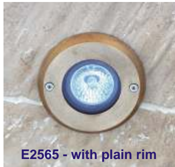
E2565 - with plain rim