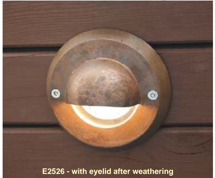
E2526 - with eyelid after weathering