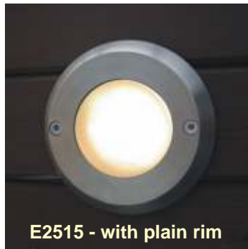
E2515 - with plain rim