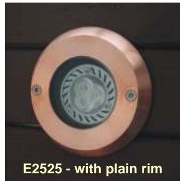
E2525 - with plain rim