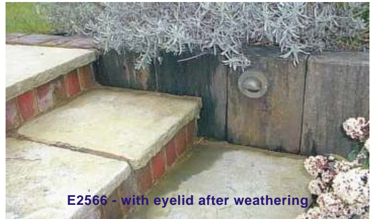
E2566 - with eyelid after weathering