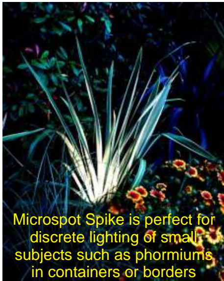
Microspot Spike is perfect for discrete lighting of small subjects such as phormiums in containers or borders