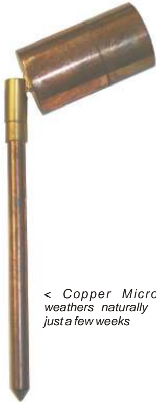
< Copper Microspot weathers naturally within just a few weeks