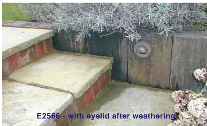
E2566 - with eyelid after weathering