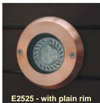
E2525 - with plain rim