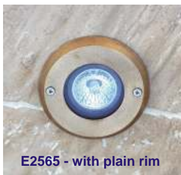
E2565 - with plain rim