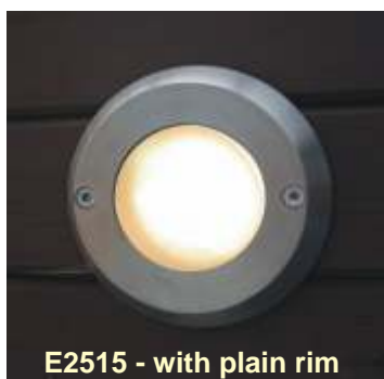
E2515 - with plain rim